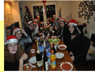
Our 2011 Christmas Party on 24 th December