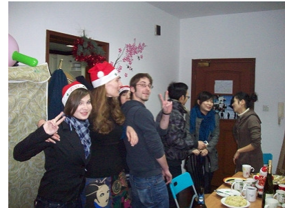
Christmas Party at volunteer flat, Dec 2009