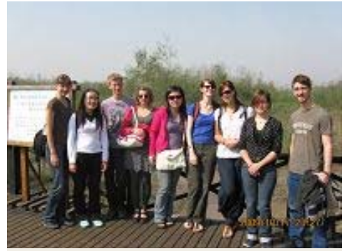
Cong Ming Farm Stay in Oct. 2009